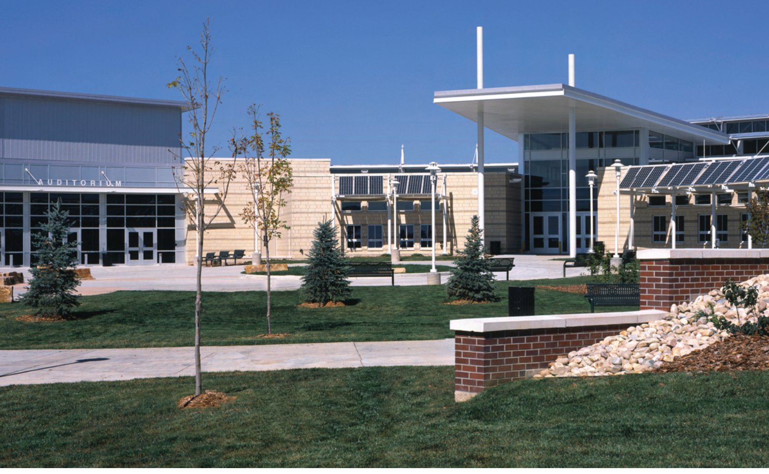
Fossil Ridge High School provides a comfortable learning environment for 1,800 students in Fort Collins, Colo.

The following article was published in ASHRAE Journal, May 2008. ©Copyright 2008 American Society of Heating, Refrigerating and Air-Conditioning Engineers, Inc. It is presented for educational purposes only. This article may not be copied and/or distributed electronically or in paper form without permission of ASHRAE