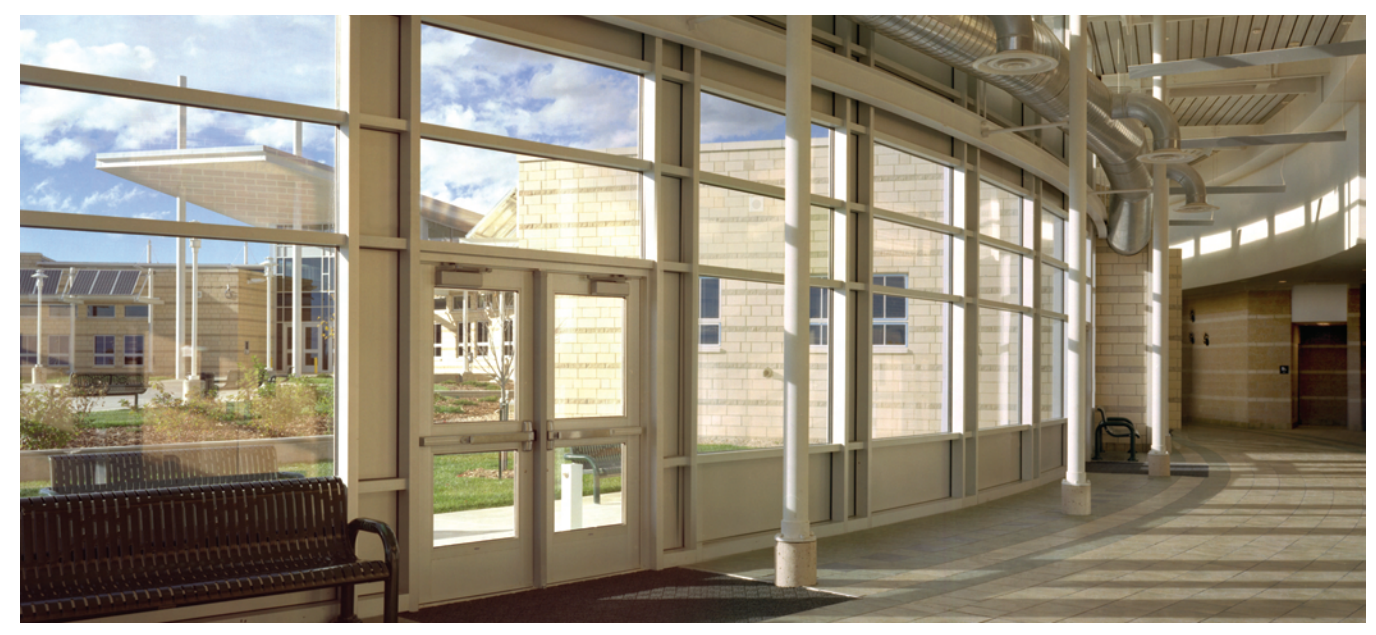
At the time of certification, Fossil Ridge was only the third high school in the United States to achieve LEED-NC Silver.

for this type of building need to change as fast as students change between classrooms. The mechanical engineering firm, MKK Consulting Engineers, implemented two simple but effective ideas: bring in outside air only when required, and use energy recovery systems to minimize the energy required to condition outside air.